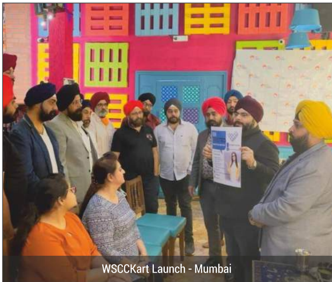
WSSCKart Launch - Mumbai