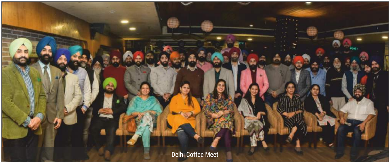
Delhi Coffee Meet