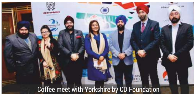
Coffee meet with Yorkshire by CD Foundation