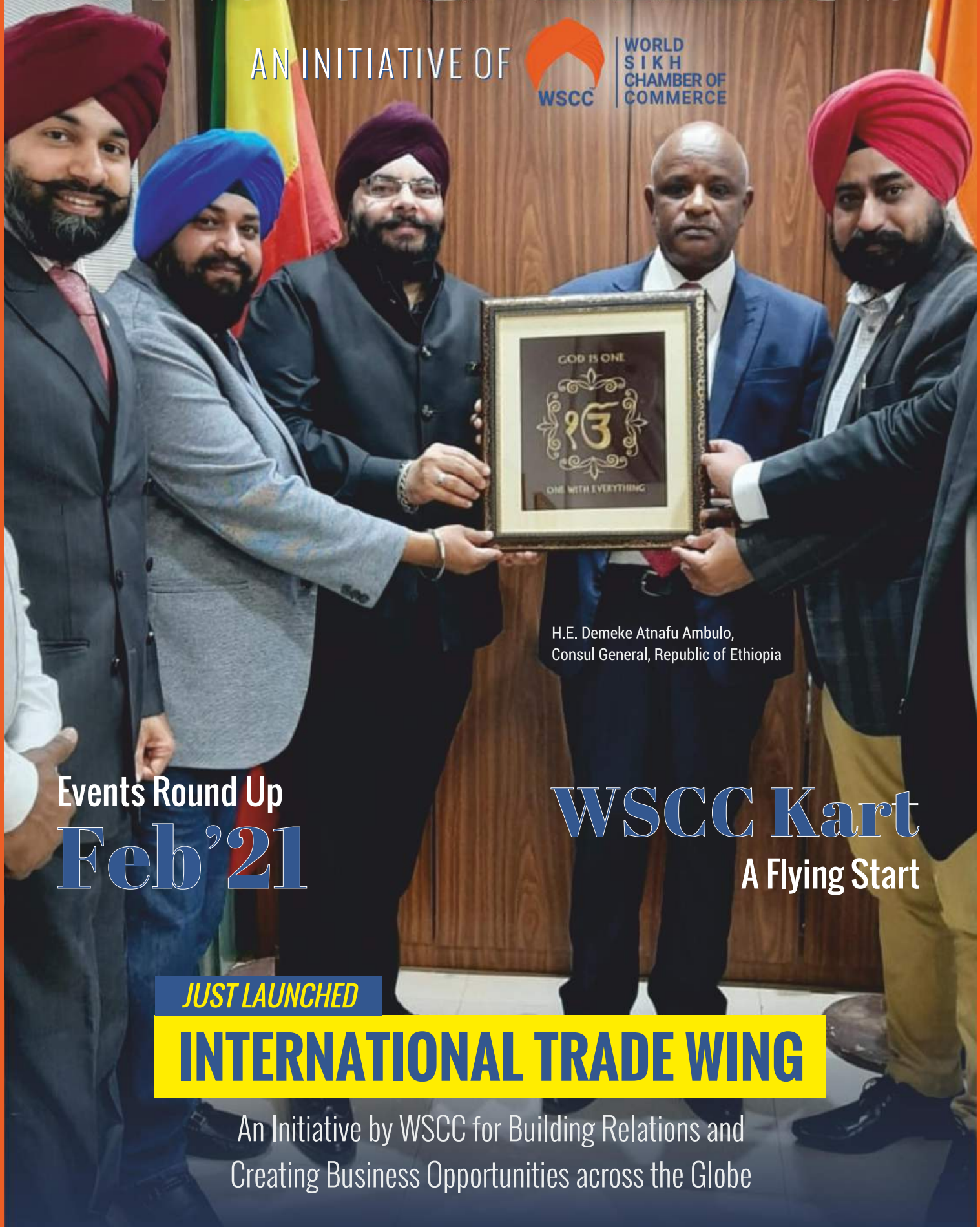
H.E. Demeke Atnafu Ambulo, Consul General, Republic of Ethiopia