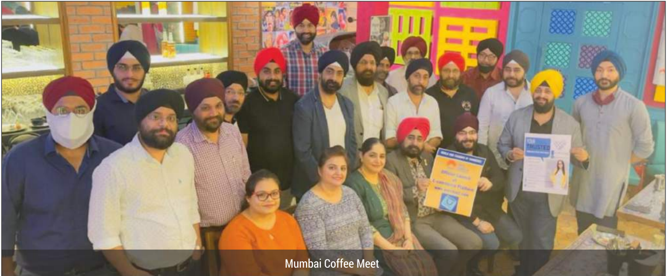
Mumbai Coffee Meet